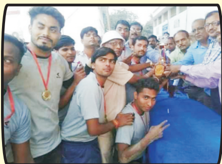
महाविद्यालय की कबड्डी टीम इंटर कॉलेज प्रतिस्पर्धा में अब्बल रही, 2018