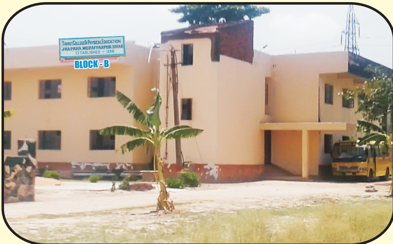
Milkha Singh, BLOCK-B