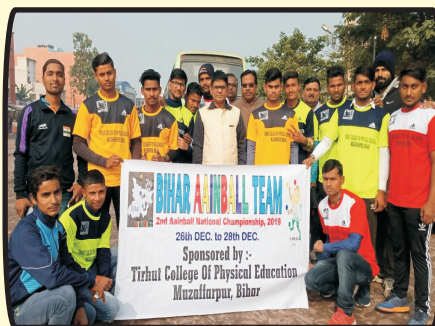
Attending National Tournament at Amritsar-2019